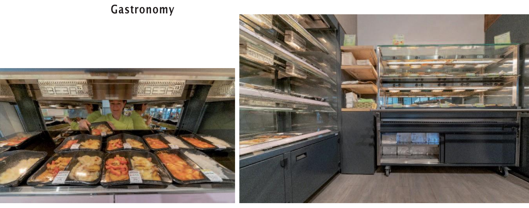
The Beer Hot Rack was designed with a mirrored sliding door back wall so that the shelves can be filled from behind, directly from the kitchen. The GN 4/1 size creates the desired product pressure, the shelves can be adjusted in height and inclined and their temperature set individually, for maximum flexibility of the display.

project, Patrick Gut had clear ideas, and, thanks to our production at our own facilities in Villmergen, we were able to respond to individual wishes.» The requirements of the shop operator were clear: