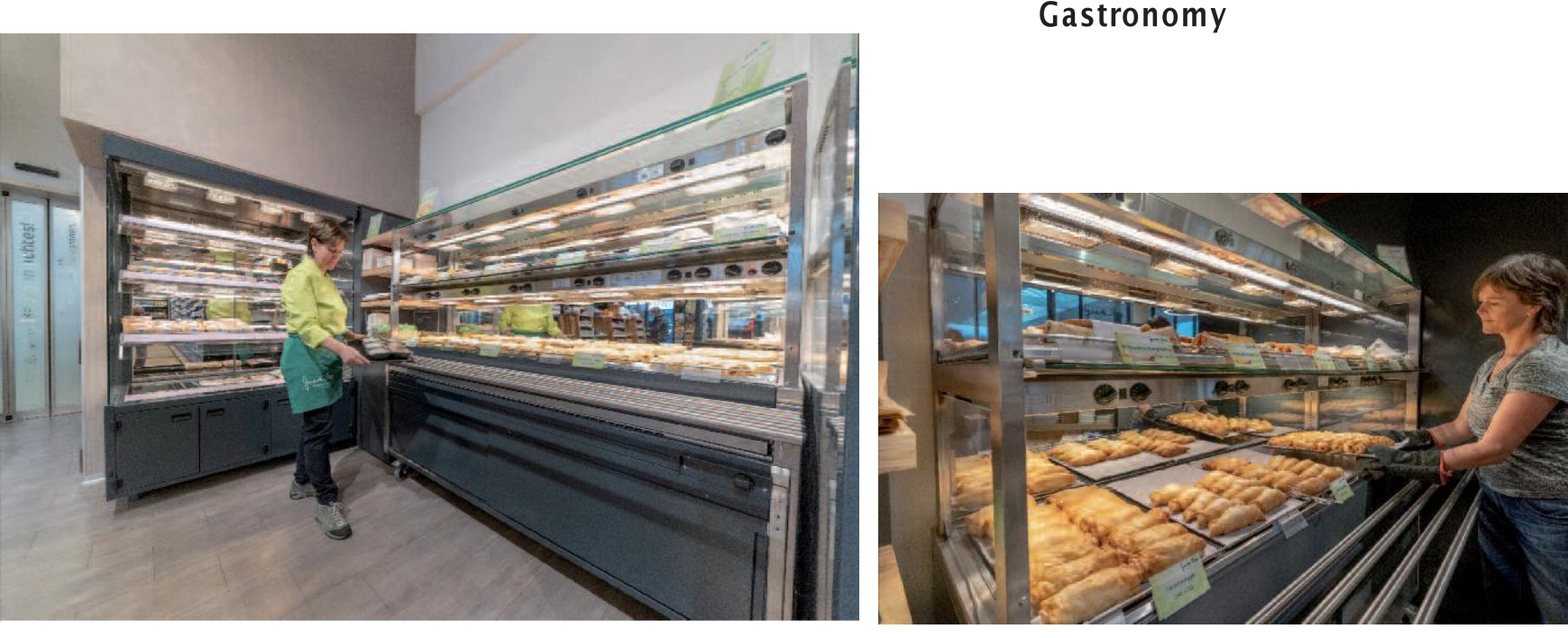
Patrick Gut had laid an eye on the Beer Grill AG food showcases for a long time. The shop remodelling project at the beginning of 2018 brought about the successful cooperation. A custom-made Beer Hot Rack GN 4/1 and a Culinario Duplex GN 4/1 are finished in a special colour tone and fitted with warm white 3000 Kelvin lighting.

Fine wines, a gift idea, sanitary necessities and pet food, accessories like caps, scarfs and headbands with a heraldic bull's head or the big weekend shopping spree – you'll find all this and more at the Guetli Shop – open seven days a week from 6:00 am to 10:00 pm.